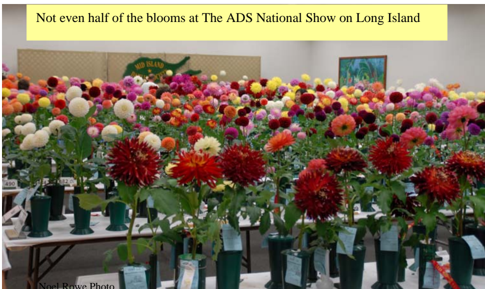
Not even half of the blooms at The ADS National Show on Long Island

A bloom from the ADS Trial Garden at Eisenhower Park Long Island,